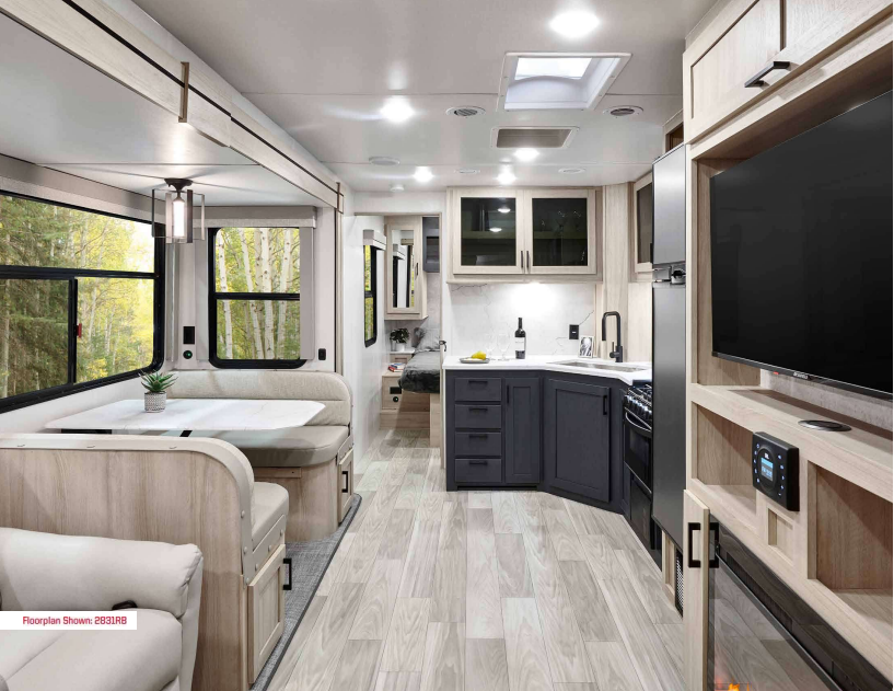
Floorplan Shown: 2831RB