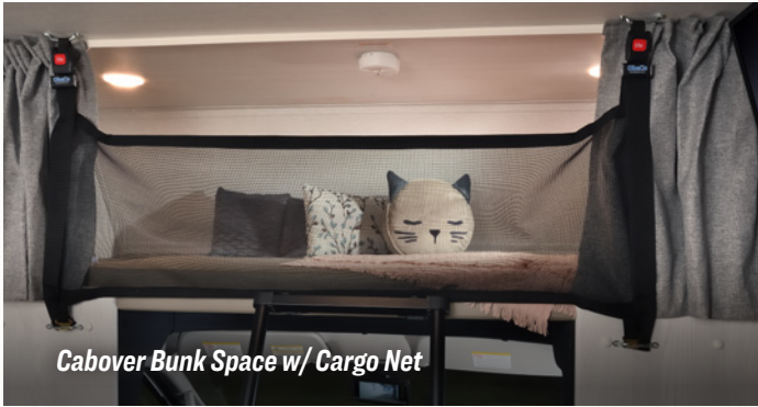
Cabover Bunk Space w/ Cargo Net