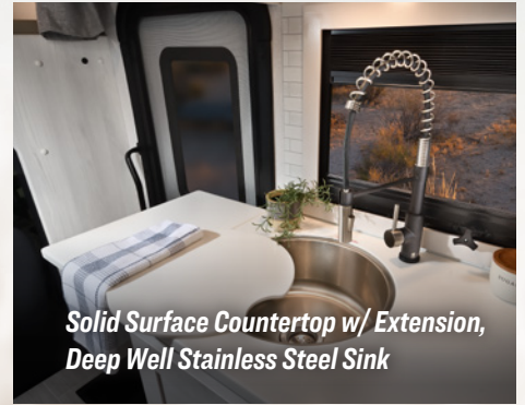
Solid Surface Countertop w/ Extension, Deep Well Stainless Steel Sink