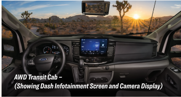
AWD Transit Cab - (Showing Dash Infotainment Screen and Camera Display)