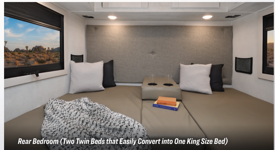
Rear Bedroom (Two Twin Beds that Easily Convert into One King Size Bed)