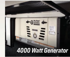
4000 Watt Generator