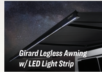
Girard Legless Awning w/ LED Light Strip