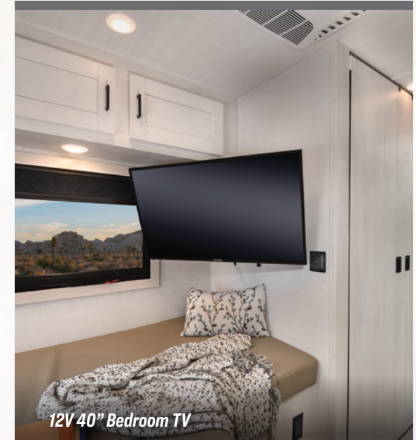
12V 40" Bedroom TV