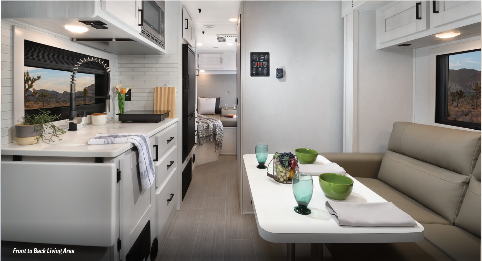
Front to Back Living Area