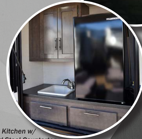
Outdoor Kitchen w/ Stamped Steel Countertop