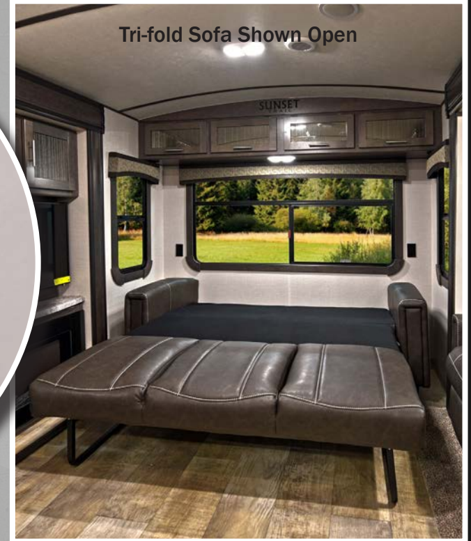
Tri-fold Sofa Shown Open