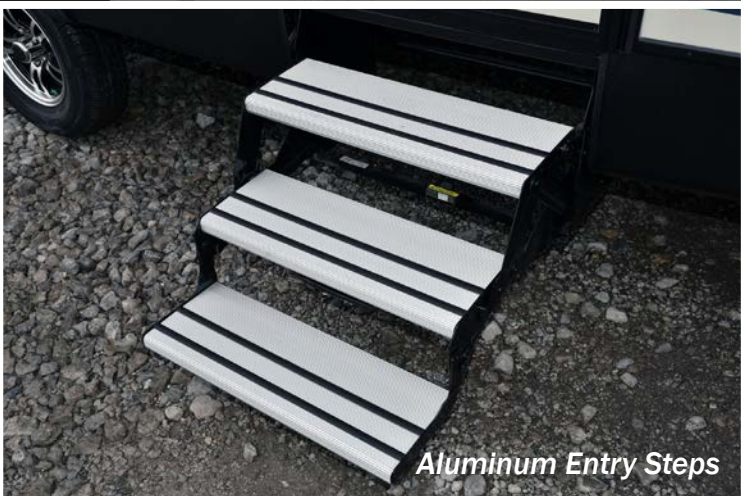
Aluminum Entry Steps