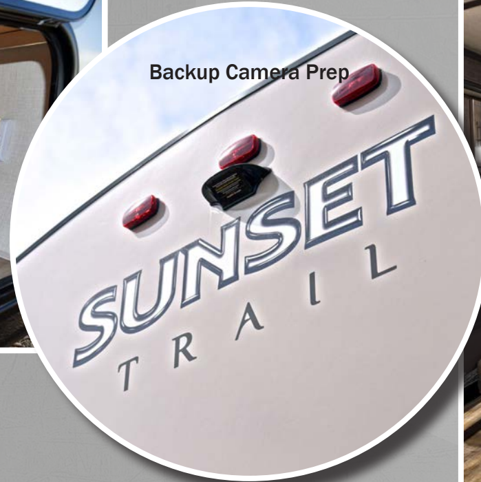
Backup Camera Prep