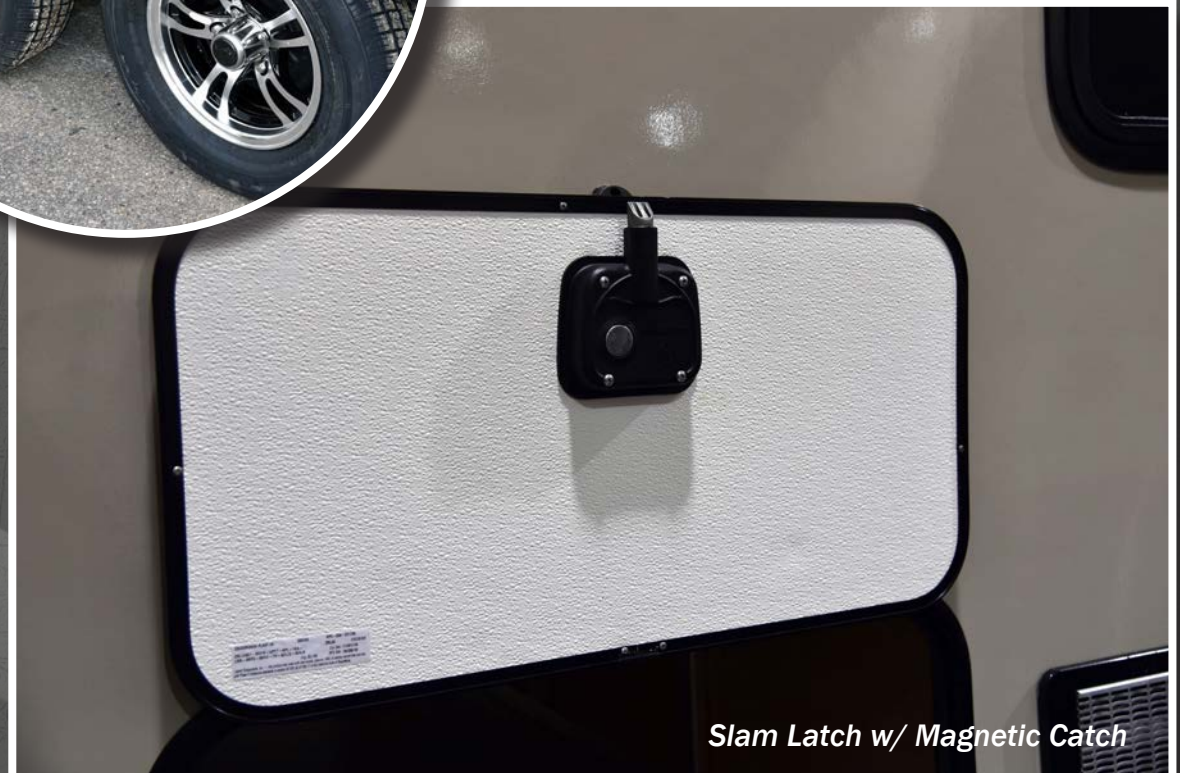
Slam Latch w/ Magnetic Catch