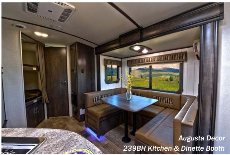
Augusta Decor 239BH Kitchen & Dinette Booth