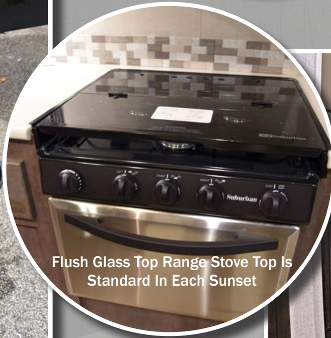
Flush Glass Top Range Stove Top Is Standard In Each Sunset