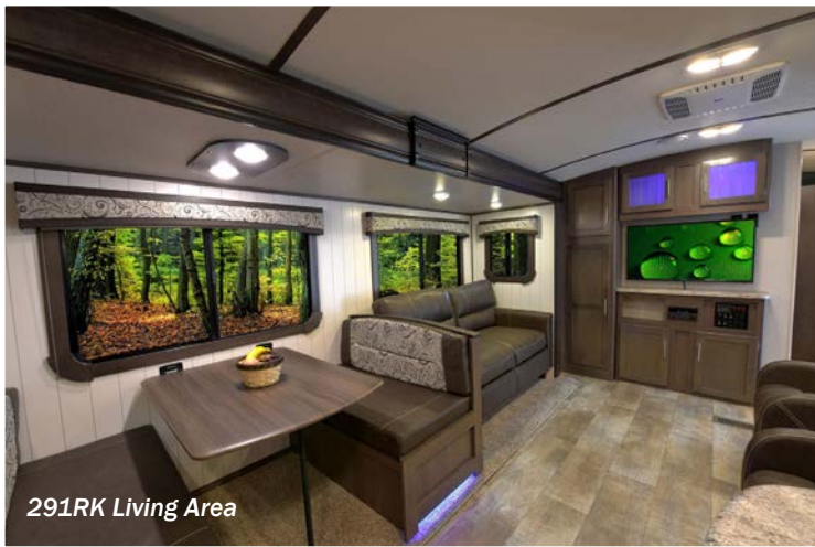
291RK Living Area