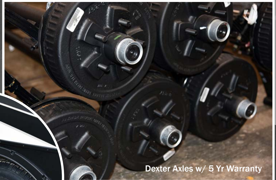
Dexter Axles w/ 5 Yr Warranty