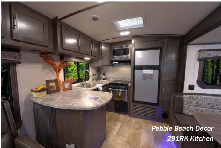
Pebble Beach Decor 291RK Kitchen