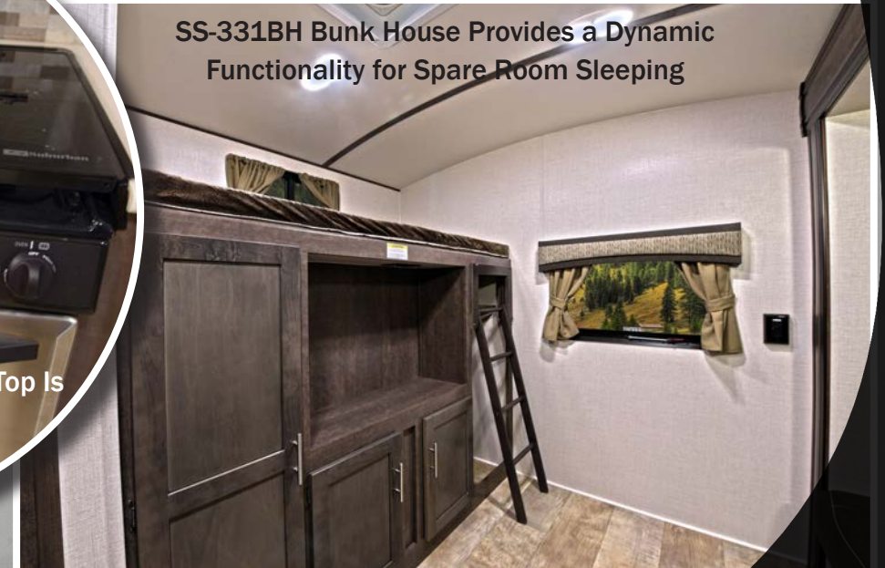
SS-331BH Bunk House Provides a Dynamic Functionality for Spare Room Sleeping