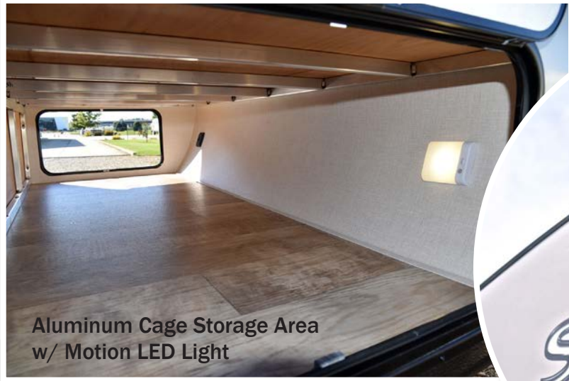
Aluminum Cage Storage Area w/ Motion LED Light