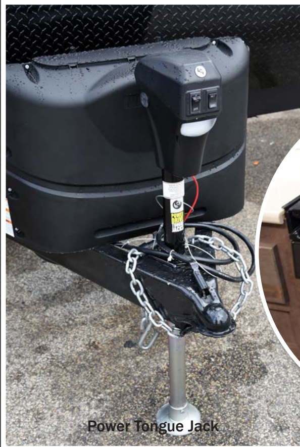
Power Tongue Jack