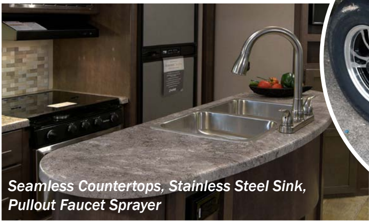
Seamless Countertops, Stainless Steel Sink, Pullout Faucet Sprayer