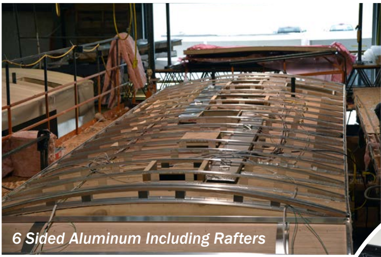
6 Sided Aluminum Including Rafters