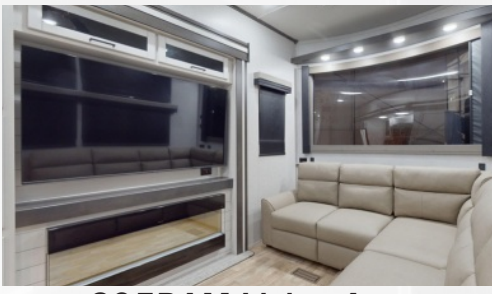
395BAM Living Area